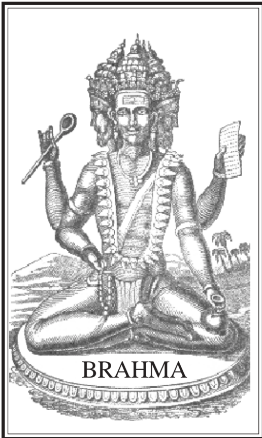
From: Encyclopedia of Religious Knowledge, Brattleboro Vermont 1840, pp.624-625

The Universal Declaration of Human Rights dreams a great dream for all peoples. The United Nations writes up arms treaties to limit wars, and proposes accords on torture to help those who have suffered. Aid for indigenous people and rules to protect children are part of the dream of all the nations. When corporations rule the world, guns are put into the hands of children; nations are saddled with unjust debts; the earth and the peoples of earth undergo bombing and environmental degradation. There is this problem we call war and the shame of political aggrandizements that include the falling of the walls of Jericho, the turmoil of the Crusades, and the presentday military occupations of territories. The human being is not made for war, but to help the human race survive. Only those leaders who believe in compassion for all people will help to prosper the earth.